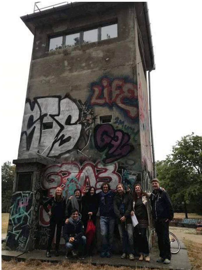
Team Meeting 13. September 2018 – “Wachturm Schlesischer Busch”, Berlin-Alt-Treptow

To commemorate the 30th anniversary of the fall of the Berlin Wall, EUROM proposes a free and open-air event inspired by Bob Dylan's song "All along the watchtower". The action will take place on September 2019 in and around one of the few remaining watchtowers of the Berlin Wall in Schlesischer Busch Park (Alt Treptow), which will be used both as a stage for live music and reading performances, and as a large-screen projection area for pictures, short pieces of films of the wall and the divided Berlin . The aim is to reach a wide audience from different origins and ages, spending special efforts in engaging young people that is keen to know more about the recent past and want to better understand the challenges of the migration waves that Europe is experiencing today.